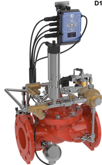
Electronic Controller D12